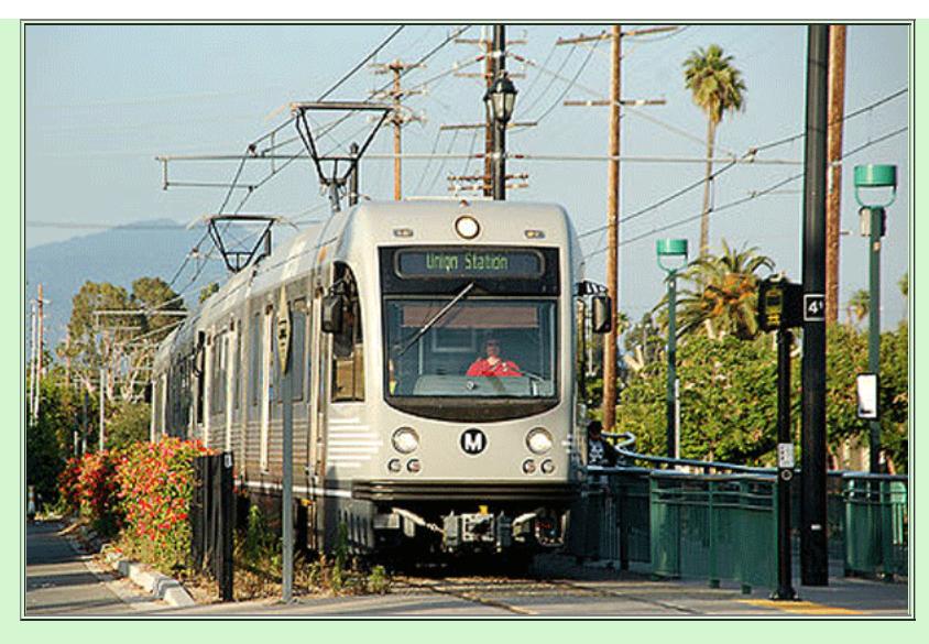
52\ P2000 vehicles from Siemens Mobility, series 201-250, 301, 302 , shown next, operate many of the lines. They were built between 1996 and 1999 and are undergoing mid-life upgrade.